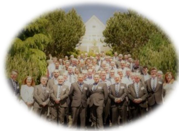
LABSS AGM & Conference 2019, Peebles Hydro

Visit our website at www.labss.org for more information.